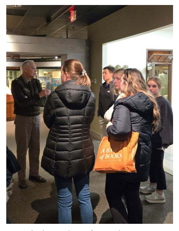
VMI cadets learning how to fire a Civil War-era muzzle loading musket (above) and Washington & Lee students taking a class in public history (above) illustrate the spectrum of learning opportunities in the museum environment.