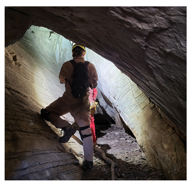
The Virginia Speleological Society mapped several caves beneath the New Market battlefield November 2024. These caves can now be monitored and entrances secured.

companion video specifically about the museum exhibits is underway.